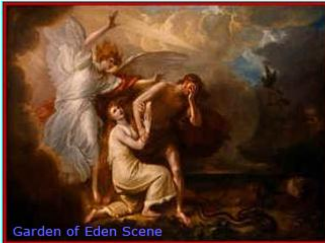
Garden of Eden Scene

Please find below three (3) simple statements of belief that will make our position at the YORWW Bible Institute perfectly clear on our unique message. First, let's consider a very familiar key bible verse found at Genesis 3:15 , which says: